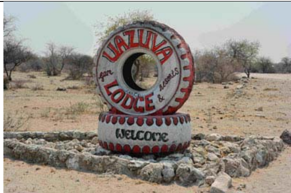
Photo 17: In the centre of Gam on the C44 lies the ghost estate of the Uazuva Lodge.

The surprisingly large village of Gam presents itself as widely spread with schools and sporadic street lighting. We were intrigued by the Uazuva Lodge, which we could see through its open gate (Photo 17, 18, 19).