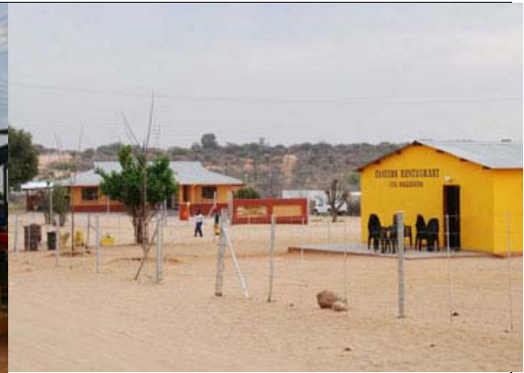
Photo 7: The Building of the Omaheke Regional Council in the far back

Epukiro is the moderately-sized district capital of the Omaheke Region. It has a few new administrative buildings. In close proximity of the Omaheke Regional Council, Martin discovered a newly opened café/restaurant serving fresh coffee, and very good chips as well (Photo 7, 8 & 8a).