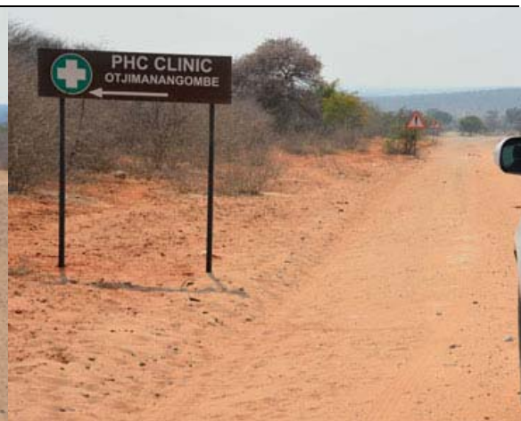
Photo 12: Reference to the Otjimanangombe Clinic: From here it is another 25km to the 45 degree bend in the C44 northward at the Okatumba Gate.

Every now and then ‘private’ farms or plots were announced by road signs – and then suddenly clinics, none of which were clearly visible (Photos 12, 13 &14).