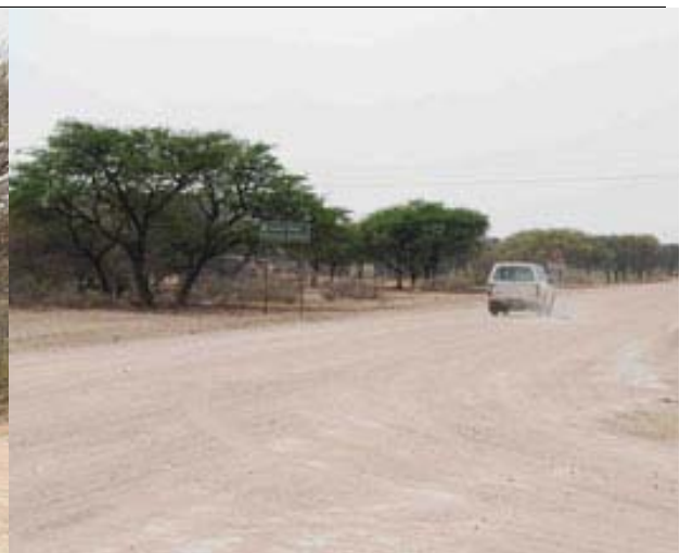
Photo 10: Epukiro: From this point onwards one simply continues straight to Tsumkwe.

We were still discussing the direction, when a car with NamWater signs stopped next to us. We decided to follow the advice of the locals and chose the MR114 to the right, the more easterly route. We were told that for years now one was waiting for the proper signposts.