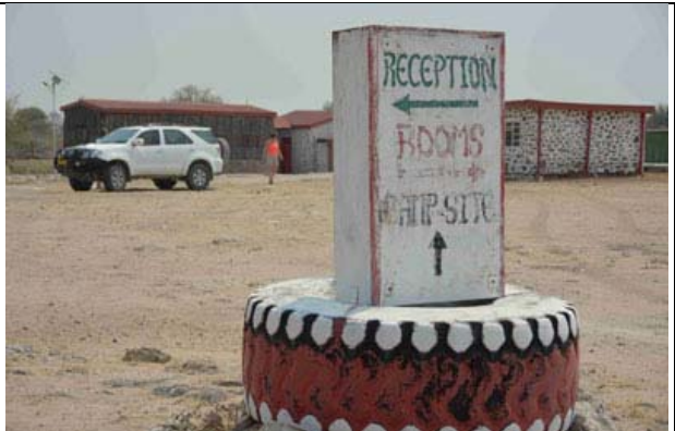
Photo 18: Gam, here nobody will be welcomed anymore. The lodge is empty.