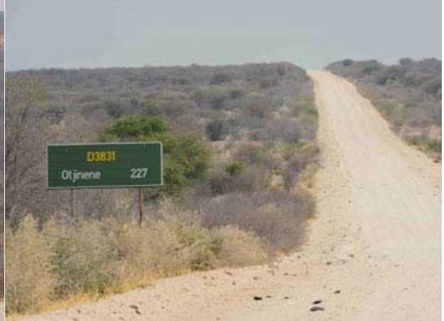
Photo 16: T-junction - the D3831 from Otjinene; for a district road the D3831 looks exceptionally good at least at its junction to the C44. Next time we will try it....