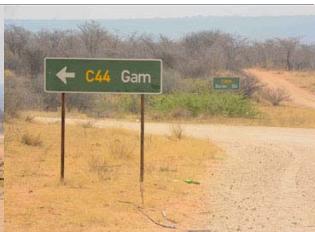
Photo 14: At the edge of the Settlement of Okatumba Gate finally the signpost for the C44 appears. Continuing straight on the D3830 is the 156km stretch along the river to Botswana.

The next 118km run straight stretch north/northeast (photo 15) until the junction with the D3831 from Otjinene (Photo 16). From here it is another mere 35km to Gam.