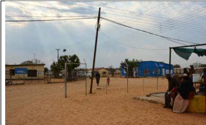
Photo 6: Epukiro: In the blue building housing the Minimark the standard cool drinks are available.