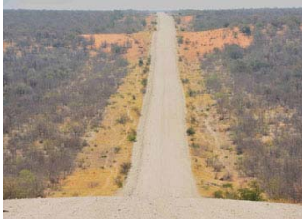
Photo 15: Straight but undulating due to the Kalahari Dunes running diagonally towards it, the C44 proceeds ever closer towards the Botswana border.