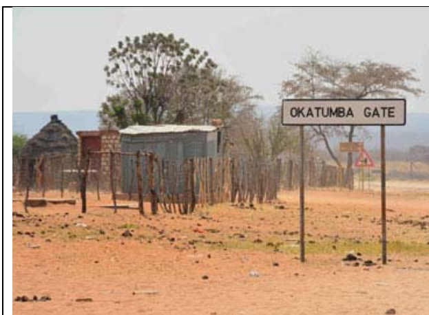
Photo 13: Okatumba Gate, a settlement not mentioned on the official map of Namibia. The yellow sign in the background indicates the location of a tyre repair workshop.

Every now and then ‘private’ farms or plots were announced by road signs – and then suddenly clinics, none of which were clearly visible (Photos 12, 13 &14).