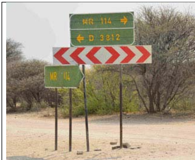
Photo 9: On the edge of town two gravel roads point northwards. The easterly one, namely the MR114, is the correct one.

After an hour (9.30am) we continued north from the town. Soon we arrived at a confusing crossing with no mention of the C44 (Photo 9 & 10).