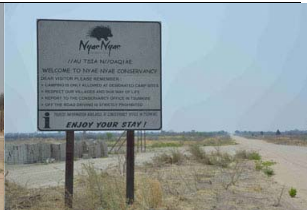
Photo21: Nyae-Nyae Conservancy - some rules to be abided by.