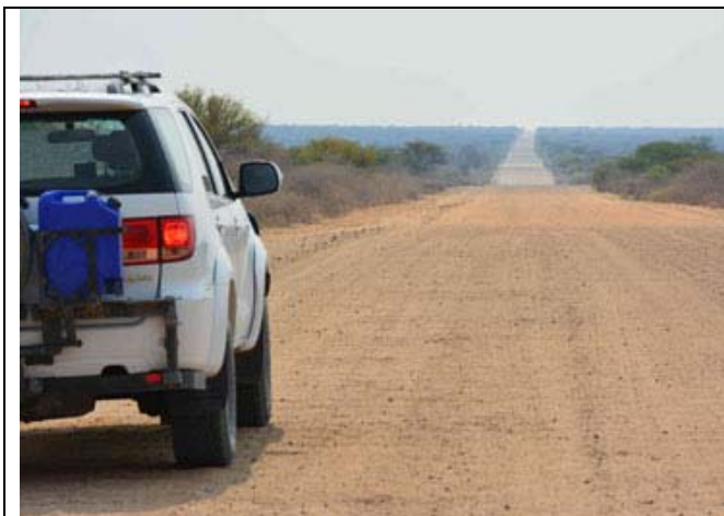
Photo 11: Approximately 10 Minutes outside Epukiro: a good gravel road, running for about 80km in an easterly direction.