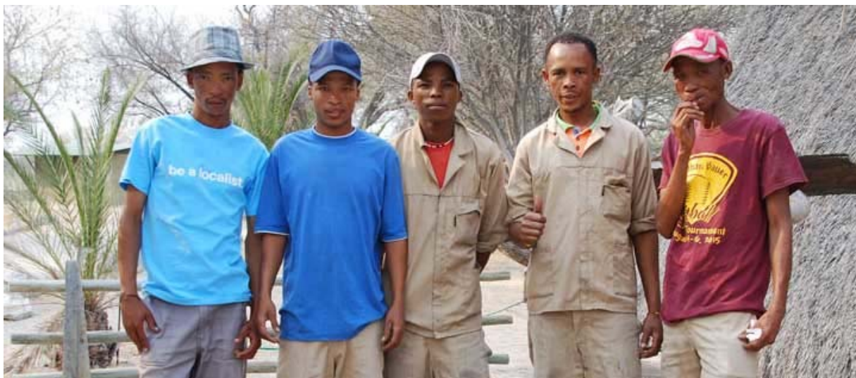
TUCSIN Tsumkwe Lodge & Staff

Information on and activities surrounding the lodge can be read on their Homepage: http://tsumkwe-lodge.com