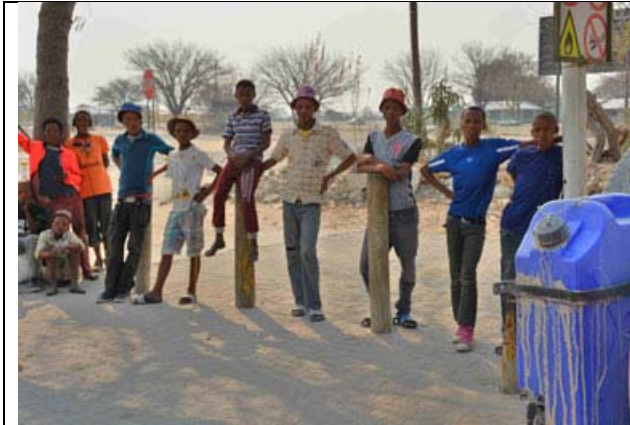
Photo 22: Waiting for something to happen; the local youth at the Gas Station