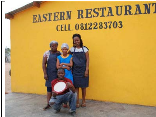
Photo 8: Epukiro: The newly opened Eastern Restaurant –here some advertising for it